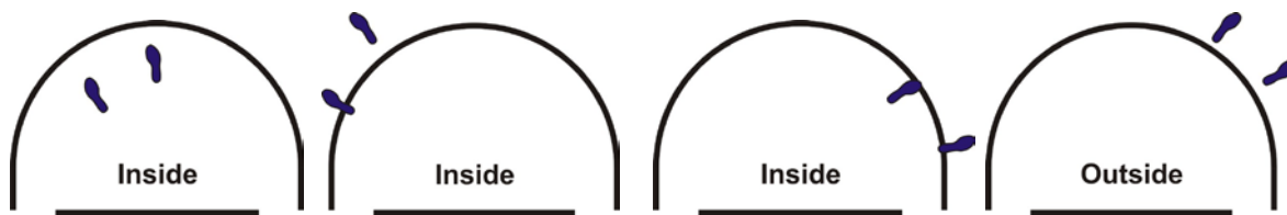
Diagram 4 Position of a player inside/outside the no-charge semi-circle area

Interpretation: A1's legal play. The no-charge semi-circle rule shall be applied.