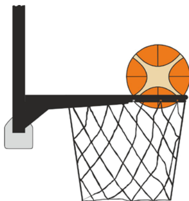
Diagram 3 Ball is within the basket

31-20 Statement. It is an interference violation if a defensive player touches the ball while the ball is within the basket.